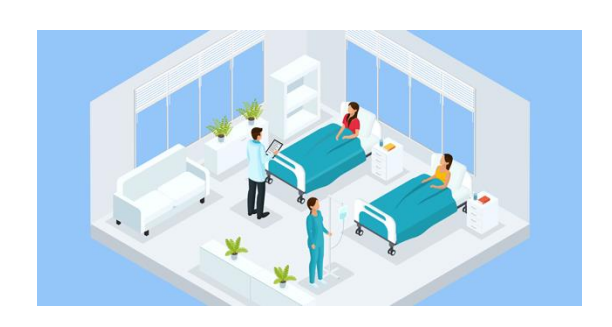
TWIN BED ROOM