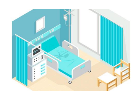
SINGLE BED ROOM