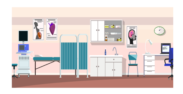
DELUXE ROOMS & SUITS